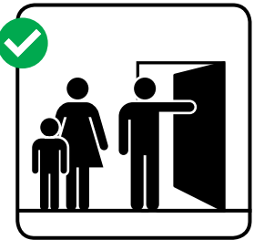
Make sure your family and visitors know how to escape in an emergency.