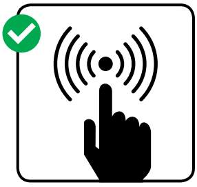
Test your smoke alarms monthly and only remove batteries when replacing them.