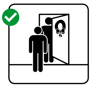
Take time to check on older relatives and neighbours this Christmas as they are at greater risk from fire.