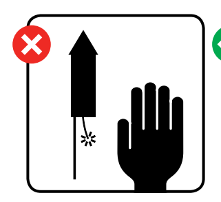
Store fireworks safely. Never go back to a lit firework and keep a bucket of water nearby.