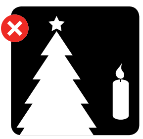
Never place candles near your Christmas tree or materials that can catch light easily.