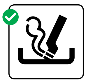
Make sure cigarettes are put out properly.