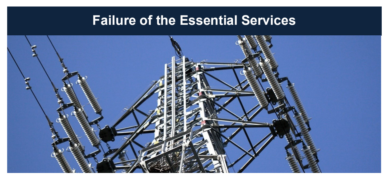
The UK's critical infrastructure is made up of electricity, water, gas, oil/fuel, transport telecommunications, food, health and financial services.