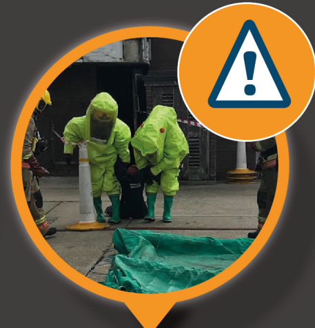
Incidents involving hazardous materials