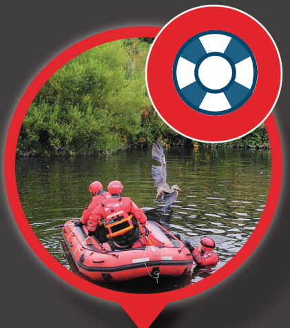
Rescues from water