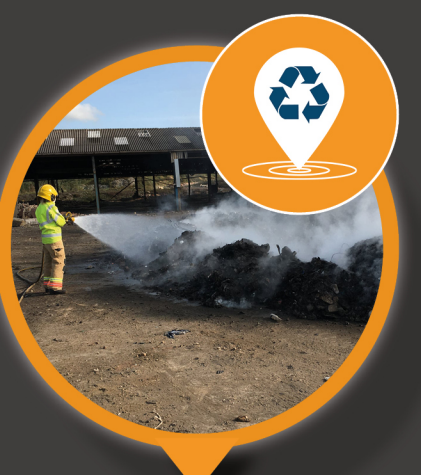
Waste and recycling sites