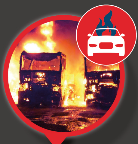
Road vehicle fire