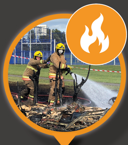
Other outdoor fires