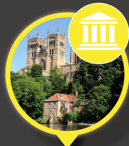
Building of heritage and special interest