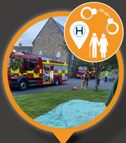
Other residential building fires