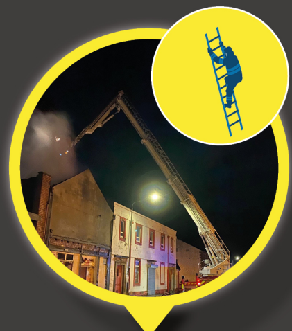
Rescues at height