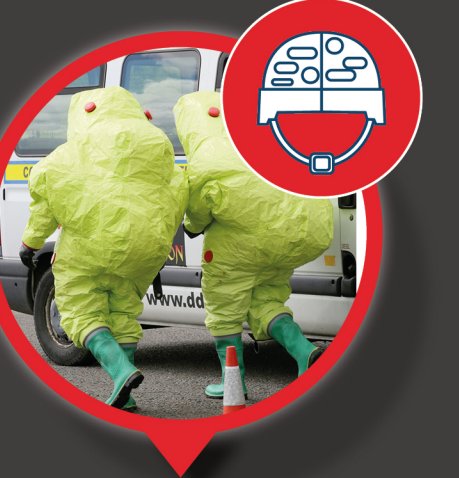
Marauding terrorist/malicious attacks