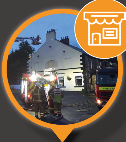
Other non-residential building fires