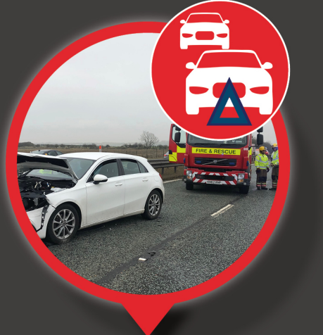
Road traffic collisions