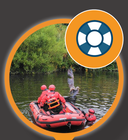
Rescues from water