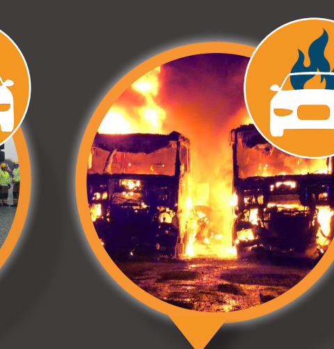
Road vehicle fire