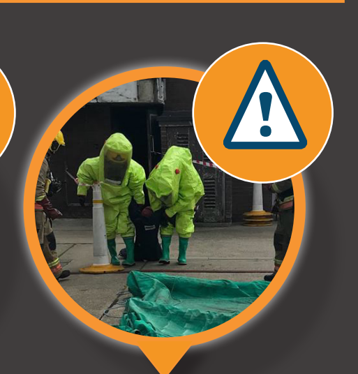
Incidents involving hazardous materials