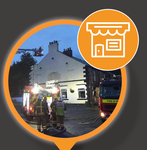
non-residential buillding fires