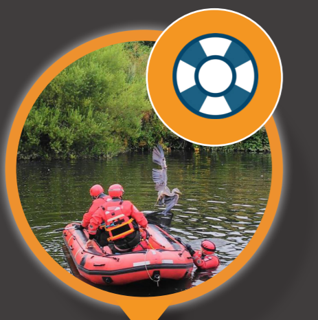
Rescues from water