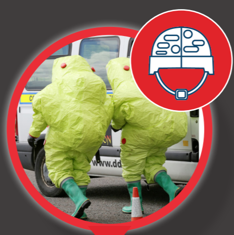
Marauding terrorist/malicious attacks