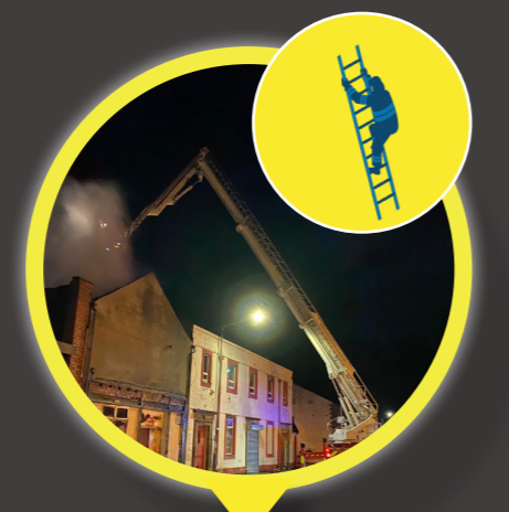
Rescues at height