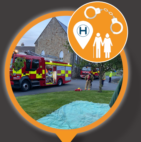
Other residential building fires