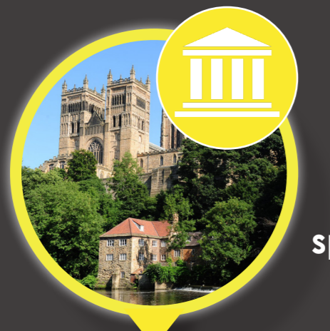
Building of heritage and special interest