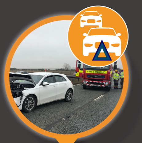
Road traffic collisions