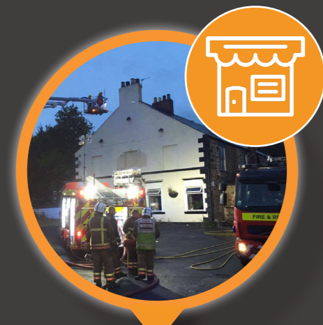
Other non-residential building fires