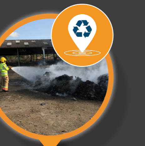
Waste and recycling sites