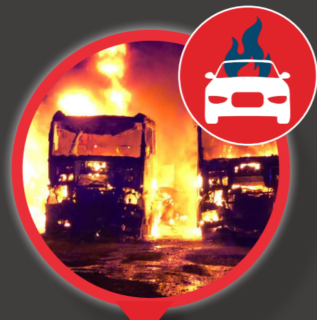
Road vehicle fire