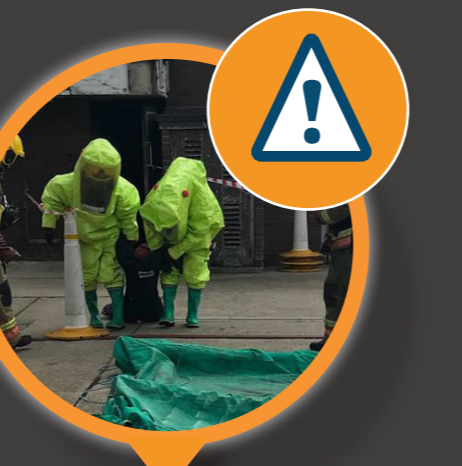
Incidents involving hazardous materials