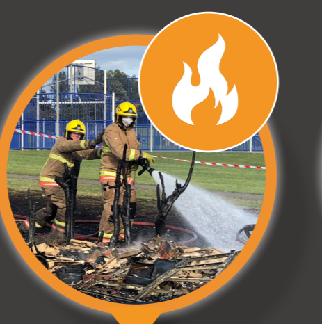
Other outdoor fires