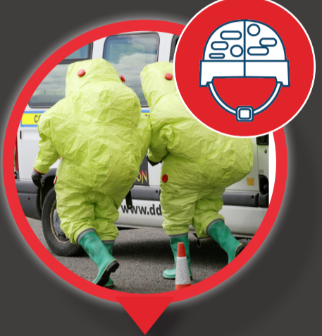
Marauding terrorist/malicious attacks