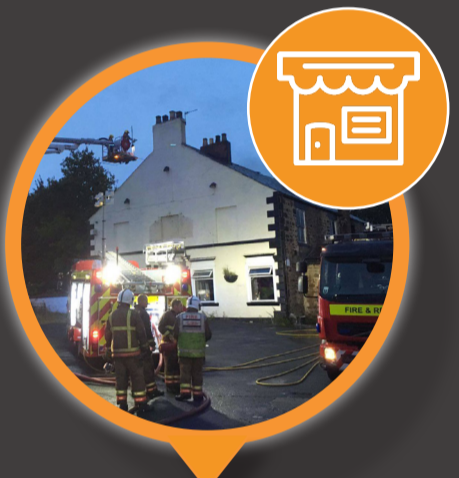
Other non-residential building fires