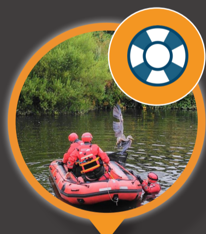
Rescues from water