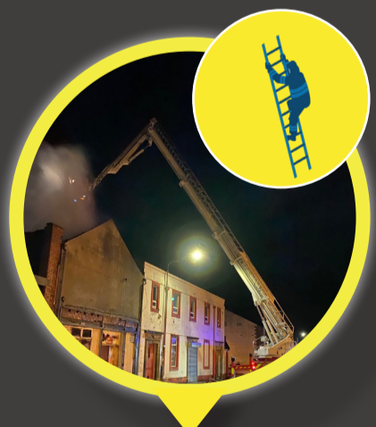
Rescues at height