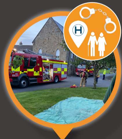
Other residential building fires