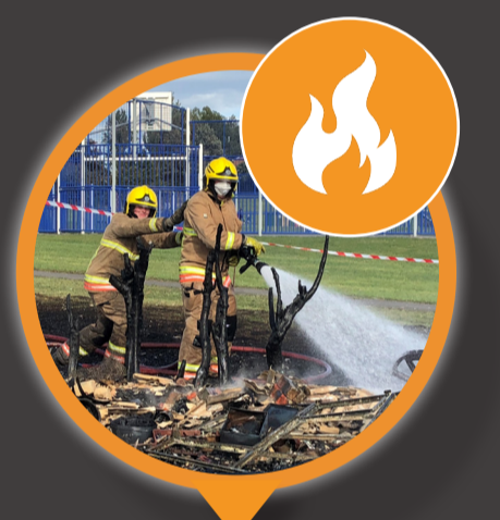
Other outdoor fires