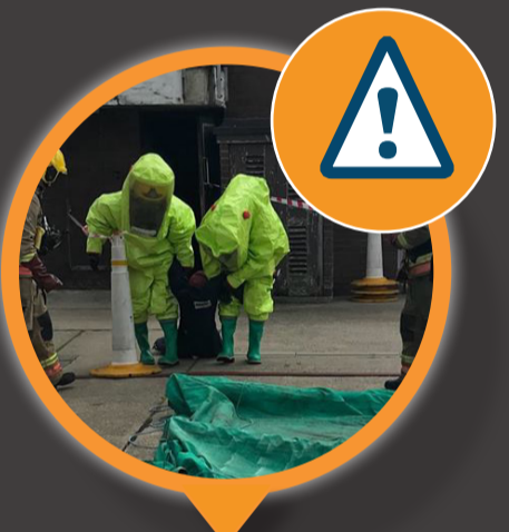
Incidents involving hazardous materials