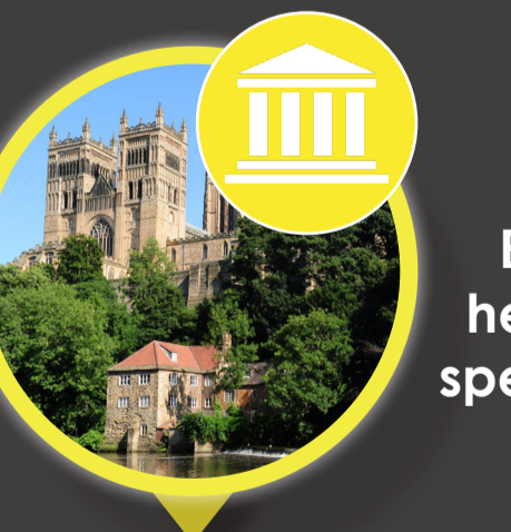
Building of heritage and special interest