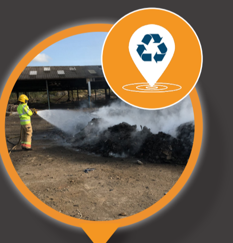
Waste and recycling sites