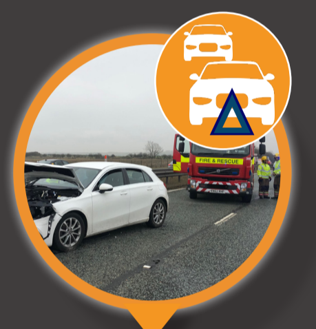
Road traffic collisions