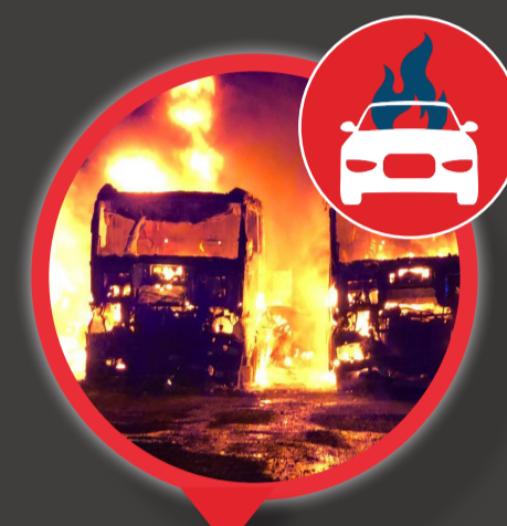
Road vehicle fire