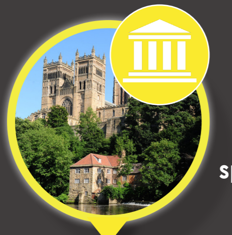
Building of heritage and special interest