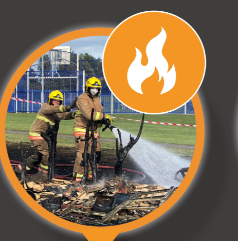
Other outdoor fires